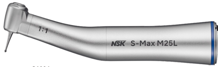
1:1 Direct Drive

OPTIC MODEL: M25L ORDER CODE: C1024 NON-OPTIC MODEL: M25 ORDER CODE: C1027