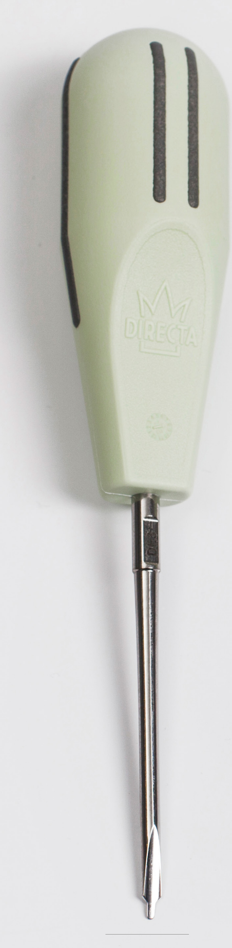
DE3 Dual Edge 506356 3/1.5 mm Straight Standard