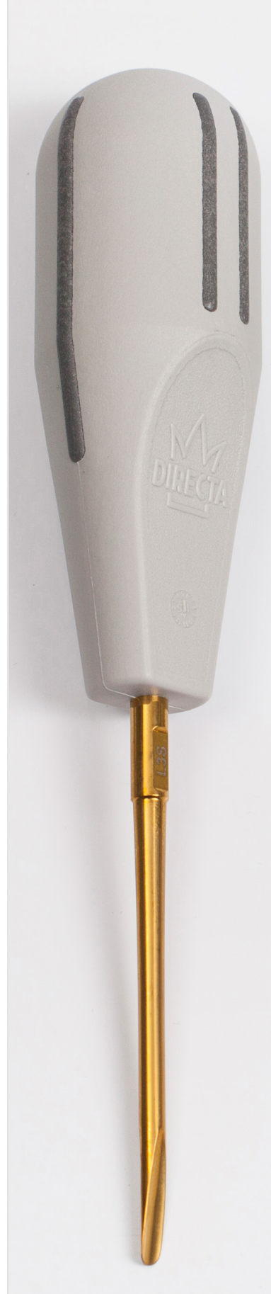
L3S TiN Periotome 506433 3mm Straight Titanium