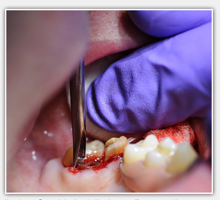
Use a Luxator Forte to judge the actual luxation status. If necessary continue with Luxator LX. If entering is hard, try to get an access point with a thin Luxator Periotome and then continue the luxation with Luxator LX.