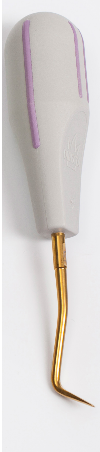
L3A TiN Periotome 506436 3 mm Angled Titanium