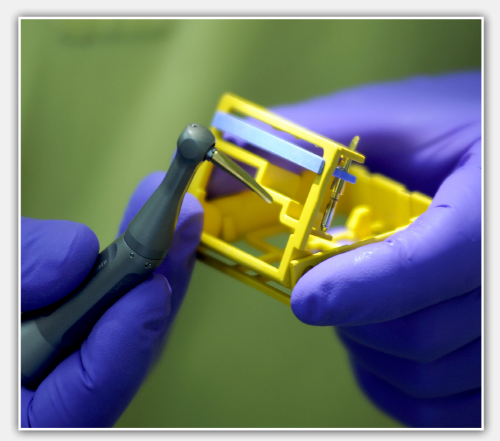
Insert the Periotome Tip into the handpiece, starting with 2mm tip.