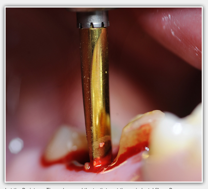
Let the Periotome Tip work around the tooth to cut the periodontal fibers. Press firmly and follow the surface of the root.