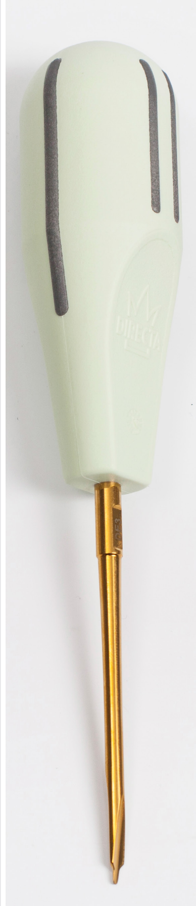
DE3 TiN Dual Edge 506435 3 mm Straight Titanium