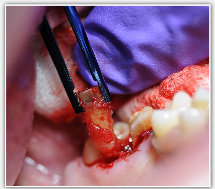
Remove the tooth with ordinary forceps or Luxator RootPicker.