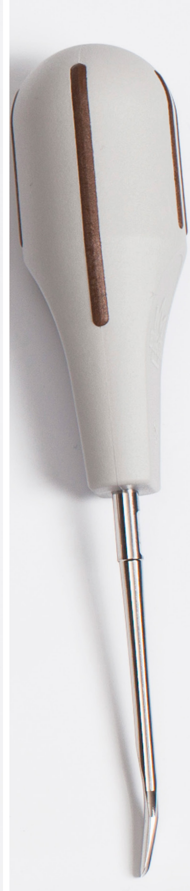
L5C Periotome 506342 5 mm Curved Standard