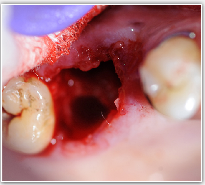
Successful extraction with minimal tissue damage.