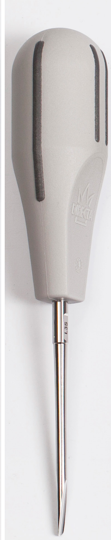
L3S Periotome 506340 3 mm Straight Standard