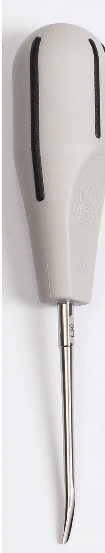
L3C Periotome 506341 3 mm Curved Standard