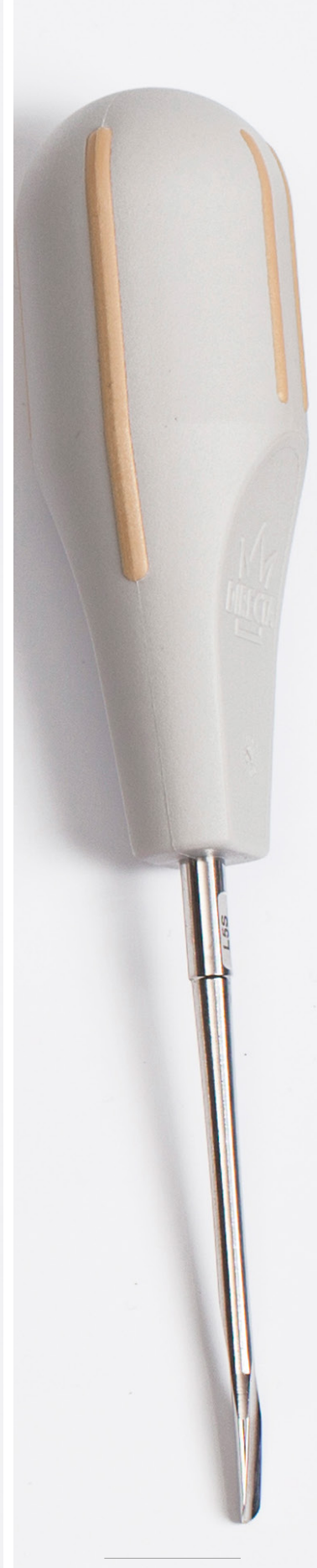
L5S Periotome 506342 5 mm Straight Standard