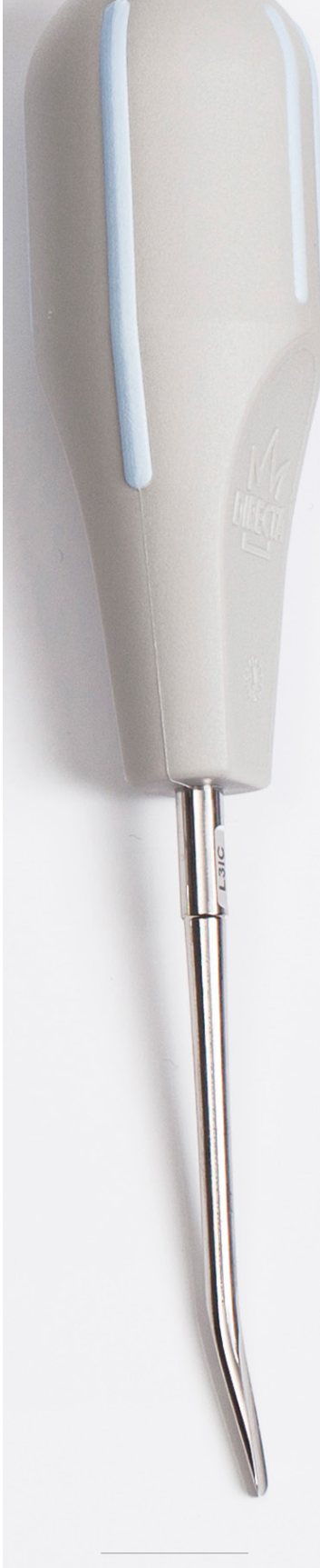
L3IC Periotome 506354 3 mm Inverted Curved Standard