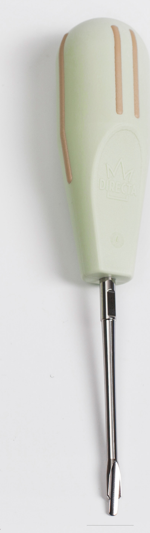
DE5 Dual Edge 506357 5/3 mm Straight Standard