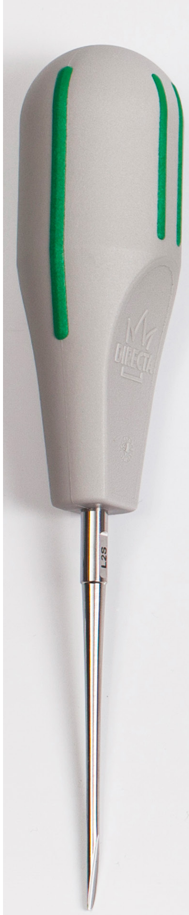
L2S Periotome 506352 2 mm Straight Standard